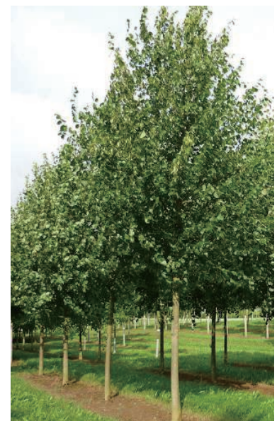
"Kaiserlinde" (Lime Tree)