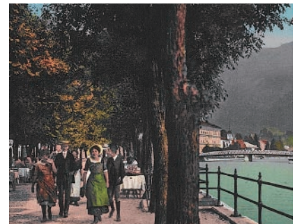
The Promenade "Esplanade" at the Beginning of the 20th Century