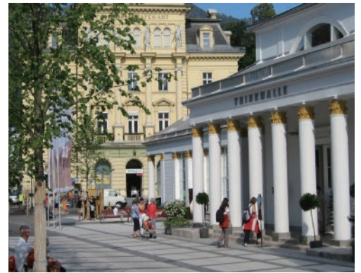
View of the Trinkhalle and the post office in the center of the town

These aims need special measures, initiations, plans and an open mind for the forthcoming scenarios. Several mistakes of the last decades have been corrected,