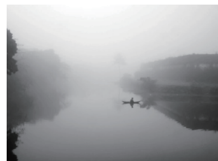
Hue in Dawn

1. Bank transfer 2. Pay on-site (only cash accepted)