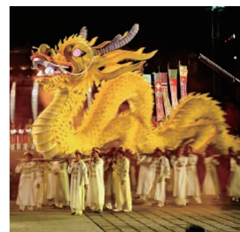
Performance at the Hue Festival