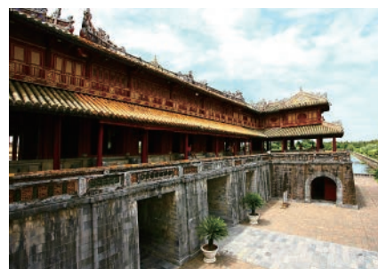
Noon Gate, Hue Citadel