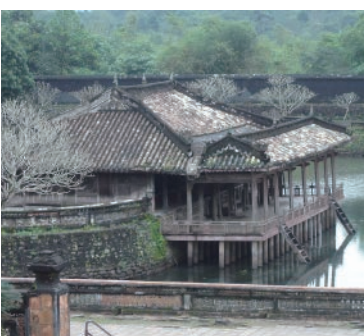
Tu Duc Tomb

The 13th World Conference of Historical Cities: 16 - 18 April 2012