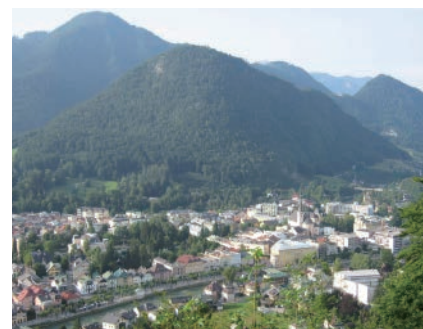
View of the Town

Ischl/Bad Ischl - Lively Historic City in the Heart of Europe