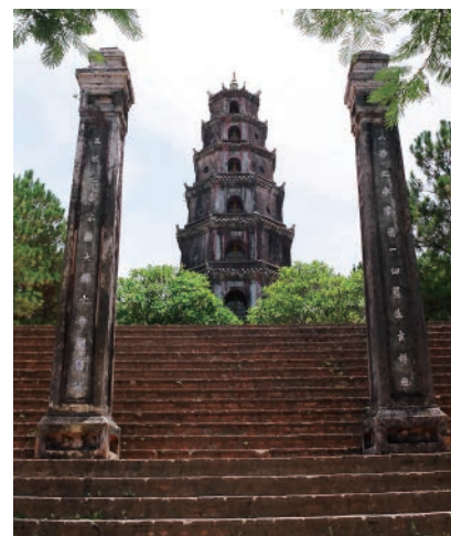
Thien Mu Pagoda