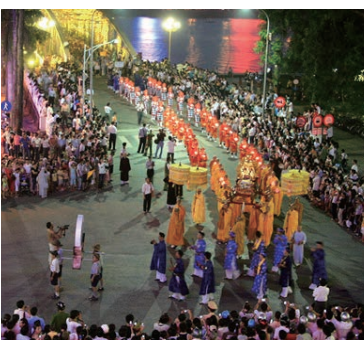
Parade of the Hue Festival