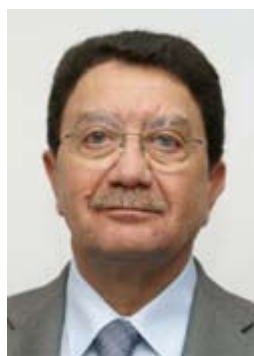
Taleb Rifai Secretary-General, World Tourism Organization (UNWTO)

Tourism has become a global phenomenon. In 2012 alone, over one billion travelers crossed international borders up from a mere 25 million in 1950. Around five to six billion more travelled domestically within their own countries.