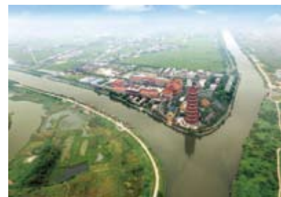
Gaomin Temple on the Grand Canal.

Youths account for 45% of the world population; they should take into consideration the current situation and many issues of mankind in the future. All major problems' settlement needs the participation of the youth. Thus the task of revitalizing historical districts is sure to rest on the youth.