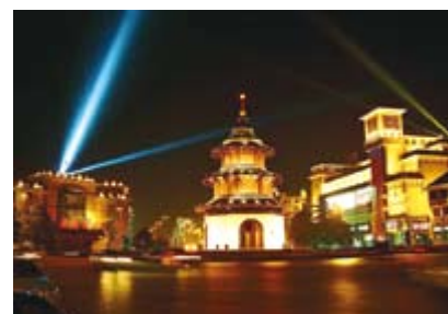
Wenchang Pavilion, Center of Yangzhou