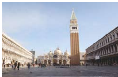
S. Mark (Venice)

In conclusion, Venice must revert to being a fully inhabited city, at the center of a vital region and with strong international dimension and basically must be a place in which a historical tradition civilization, democratic conscience, and tolerance accompany the ability to answer the challenges posed by modernity with confidence.