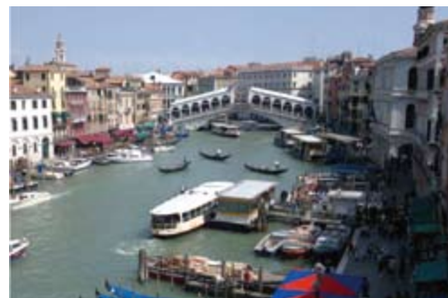
Rialto Bridge (Venice)