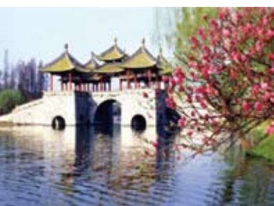
Slender West Lake