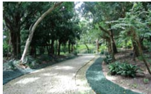
Stone pavement after construction the drainage system

Today, 10 years after the designation of World Heritage site, social environment and situation of this facility has changed. Therefore in order to cope with these changes and maintain the value of this property, proper measures for conserving and managing it must be taken.