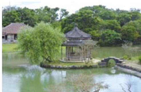
Rokkaku-Do, Hexagonal Building