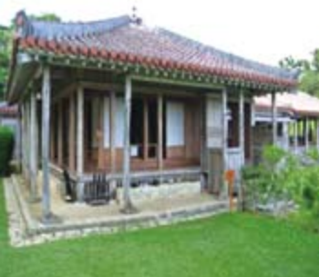
UDUN, Palace of the Royal Family of the Ryukyu islands

E-mail: 31089naom@city.naha.lg.jp Web: http://www.city.naha.okinawa.jp/cms/kakuka/kyouikubunkazai/sikileafenglish.pdf