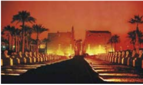
The Avenue of the Sphinxes (Luxor)