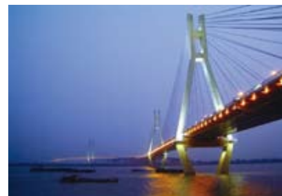
Runyang Yangtze River Bridge