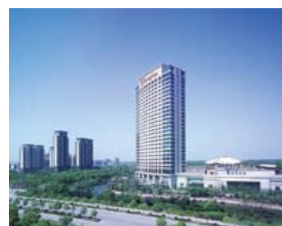
Shangri-La Hotel, Yangzhou, China

The 14th World Conference of Historical Cities will be held in the City of Yangzhou, China in this September. Please visit the conference website http://14lhc.yangzhou.gov.cn , which will be completed in this April, for further details and registration.