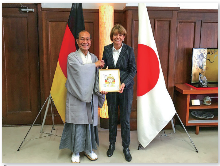
3 Cologne (Germany) Date: Oct. 27, 2017 Mayor Henriette Reker

Mayors from member cities of Shiraz, Tainan, and Cologne visited Kyoto City Hall, and met with various representatives including Mayor Kadokawa and City Assembly Chairperson Terada for informal talks where they agreed to deepen the friendships between their cities through activities within the League of Historical Cities.