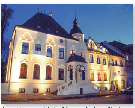
Jugendstil ("youth style") building near the Liepų Street.