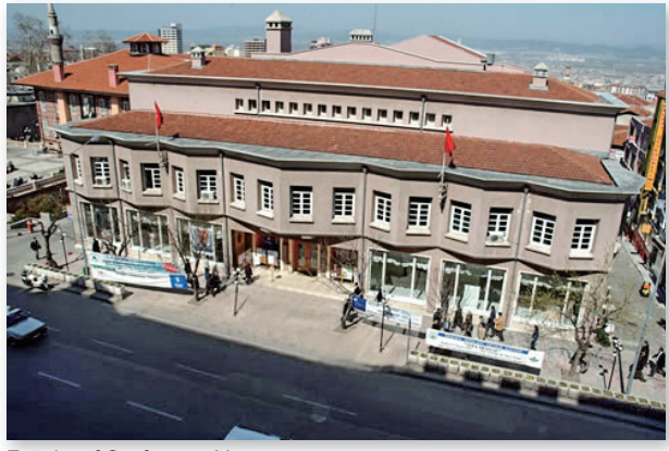
Exterior of Conference Venue