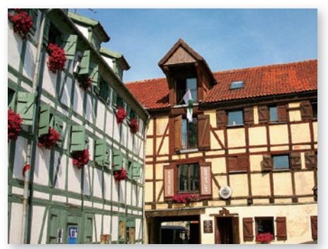
"Art yard" – arts and crafts space in Klaipėda