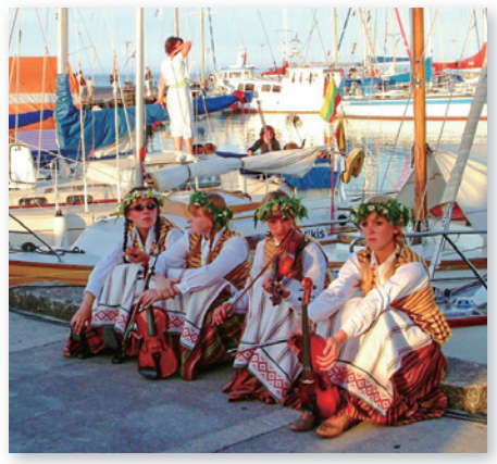
Girls in traditional dress

The first mention of Lithuania dates back to the 11<sup>th</sup> century. The town of Klaipeda (Memel) in Lithuania was founded in 1252. Klaipeda is a unique Lithuanian city by virtue of its colorful and turbulent history. Also, the Old Town's architectural style is similar to many western European cities with which it had close links.