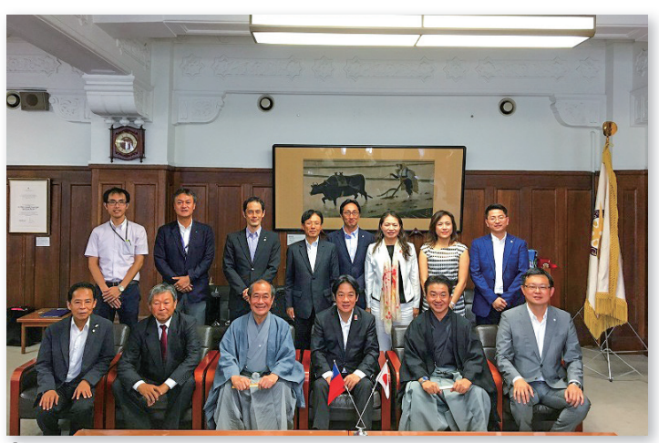
② Tainan (Chinese Taipei) Date: Aug. 9, 2017 Mayor Lai Ching-Te (at the time)