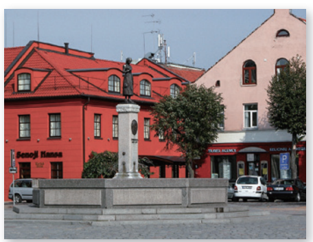
Theatre square. Monument to the poet Simon Dach